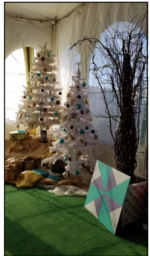
The barn quilt blocks members painted at the November workshop made great decorations for the Christmas luncheon.