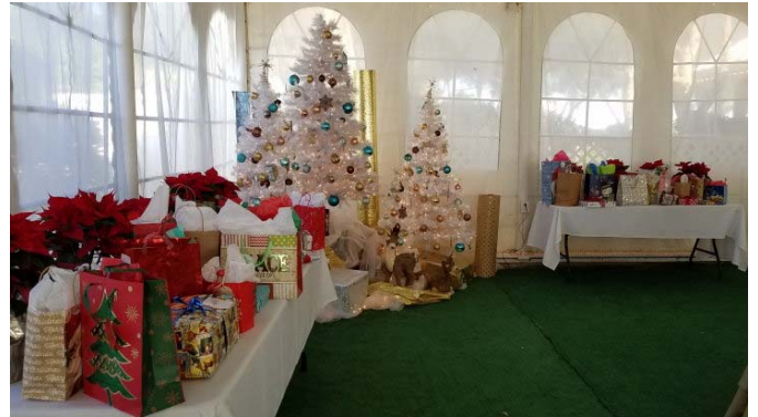
Lots of presents were brought for our gift exchange!