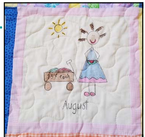
Here is an example of the cute blocks you can color at the workshop!

If you would like to help assemble these blocks ask for a kit, or join members every Tuesday at 10 am at Hillside Community Church, 1097 W Linda Vista Ave. Porterville.